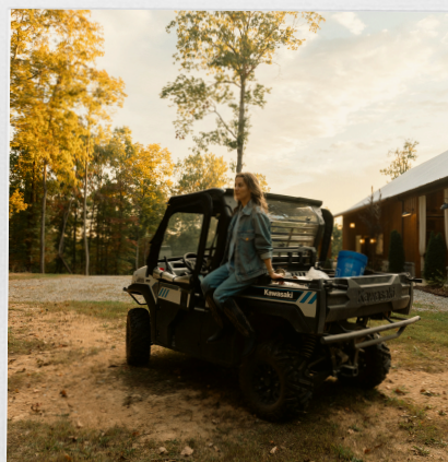
side by side rides at the ranch