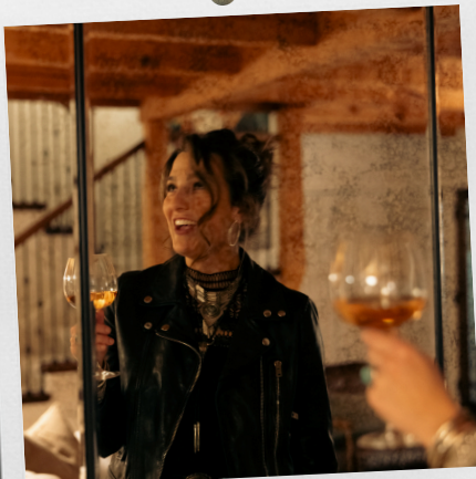
finding the best mocktails