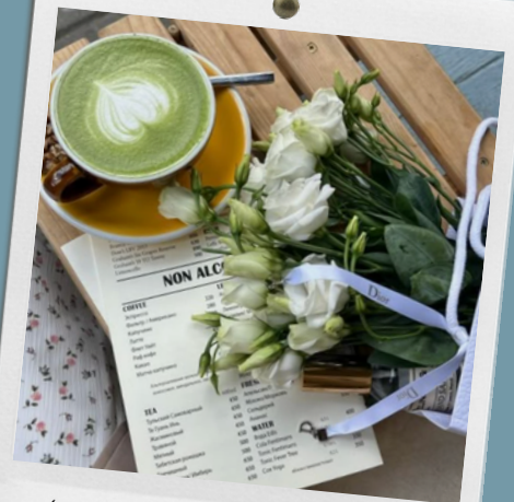
tasting every matcha in town!