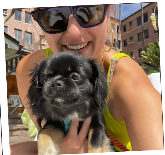
ME & MY POPPY GIRL